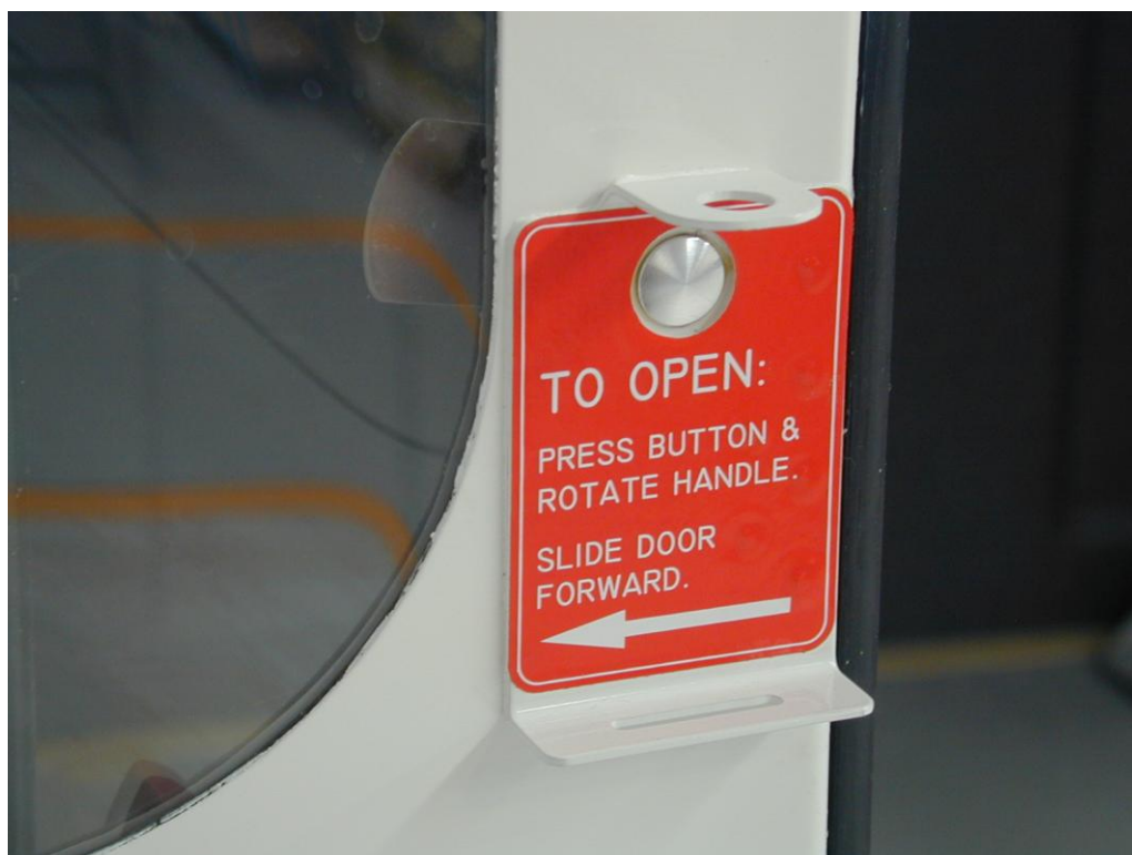
Figure 2: Installed Cabin Door Lock Bracket