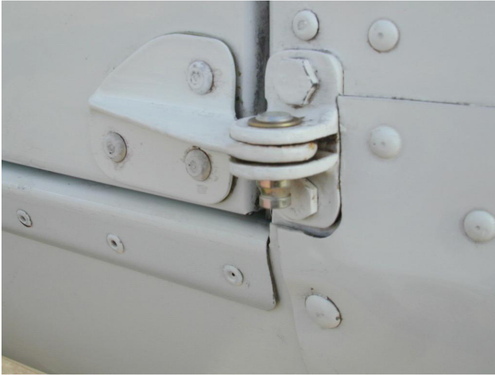
Figure 3: Tamper Proof Forward Door Hinge Pins